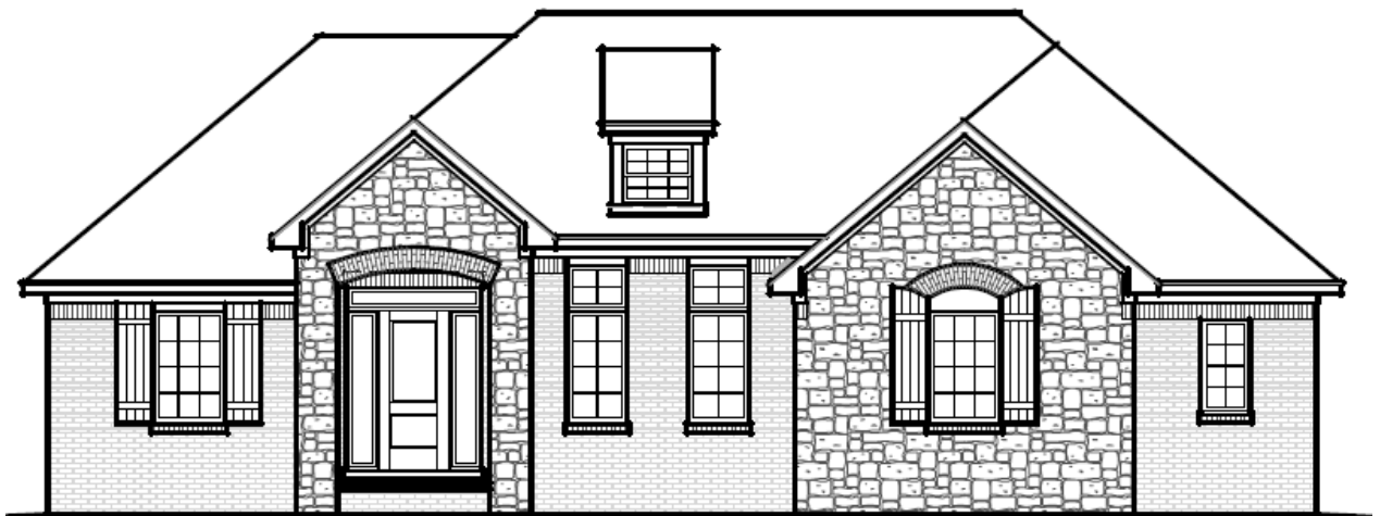
FRONT ELEVATION "C"

In our continuing effort to meet homebuyer's expectations, we reserve the right to modify features, prices, specifications and/or to change or discontinue models without notice or obligation. Cathedral, coffered and step ceilings, dual vanity sinks, fireplaces, bay windows and oversized garages are considered optional features unless specified in Community Standard Home Features. Floor plan dimensions are approximate. Room dimensions do not include optional bays or box outs. Floor plan may vary from actual home. Ceiling designs may vary per elevation. Premium elevation shown.