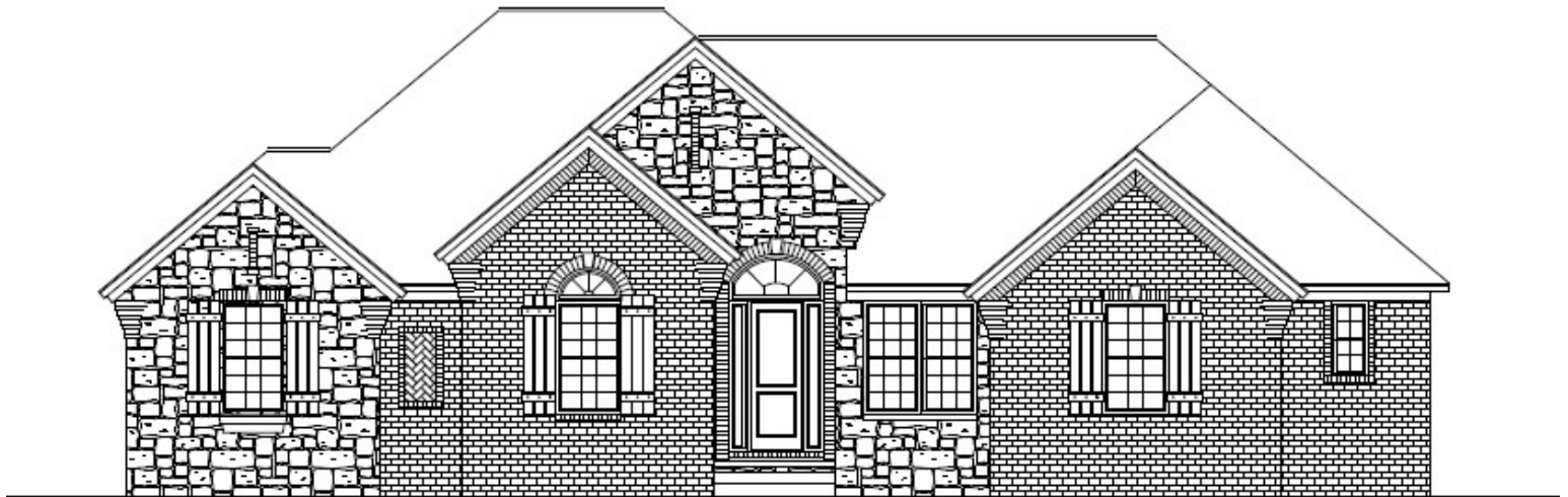
MADISON ELEVATION B FRONT ELEVATION

In our continuing effort to meet homebuyer's expectations, we reserve the right to modify features, prices, specifications and/or to change or discontinue models without notice or obligation. Cathedral, coffered and step ceilings, dual vanity sinks, fireplaces, bay windows and oversized garages are considered optional features unless specified in Community Standard Home Features. Floor plan dimensions are approximate. Room dimensions do not include optional bays or box outs. Floor plan may vary from actual home. Ceiling designs may vary per elevation. Premium elevation shown.