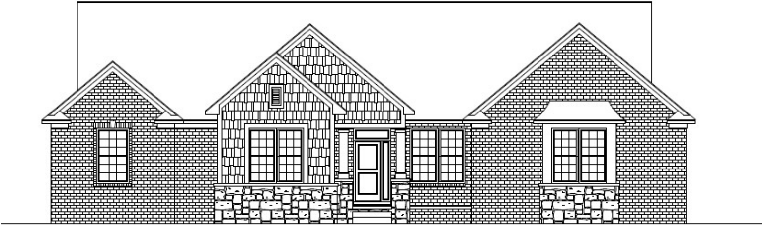
MADISON ELEVATION A FRONT ELEVATION