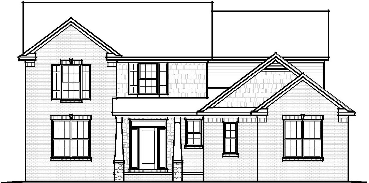
"The Breckenridge" Front Elevation

In our continuing effort to meet homebuyer's expectations, we reserve the right to modify features, prices, specifications and/or to change or discontinue models without notice or obligation. Cathedral, coffered and step ceilings, dual vanity sinks, fireplaces, bay windows and oversized garages are considered optional features unless specified in Community Standard Home Features. Floor plan dimensions are approximate. Room dimensions do not include optional bays or box outs. Floor plan may vary from actual home. Ceiling designs may vary per elevation. Premium elevation shown.